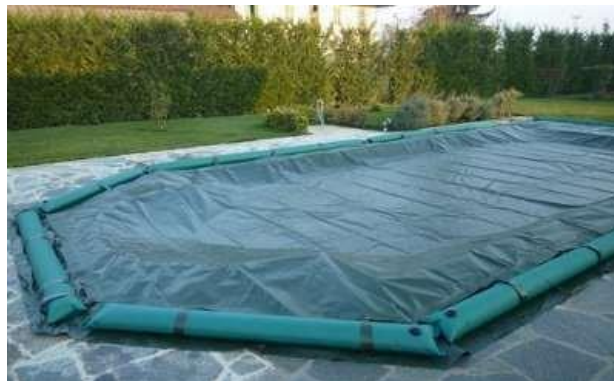
Copertura invernale con serbatoio a tubolare